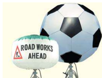
Decorated Balloon Replaceable with various balloons.