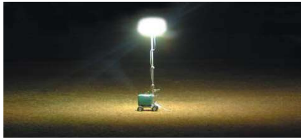
Large and 360 degrees area can be illuminated by homogeneous lighting.

Glare-Free Lighting. Safe for surrounding traffic.