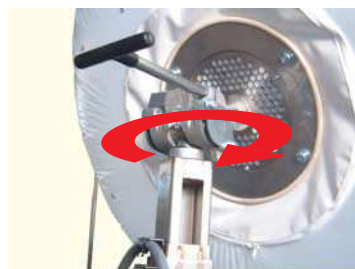
Adjust Handle sets any position of balloon.