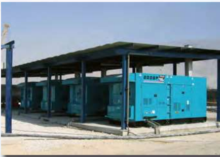
As the power source in the area where electricity is unavailable.