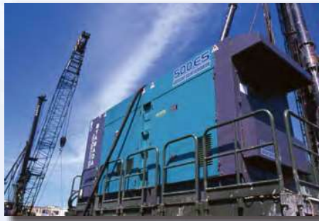
As the power source in the construction site.