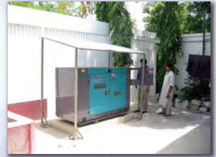
As the Emergency power source in the hospital.