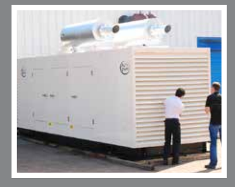
Please Note: Above photos may not relate directly to accompanying datasheet model