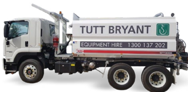
BOGEY AND SINGLE AXLE

Options available; tailgates*, swivel bins**, 4WD & 6WD and tracked.