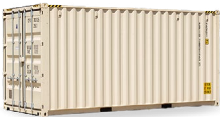
CONTAINERS / STORAGE