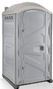
TOILETS AND SHOWERS

Accessories available: storage racking, lock boxes and plumbers' boxes.