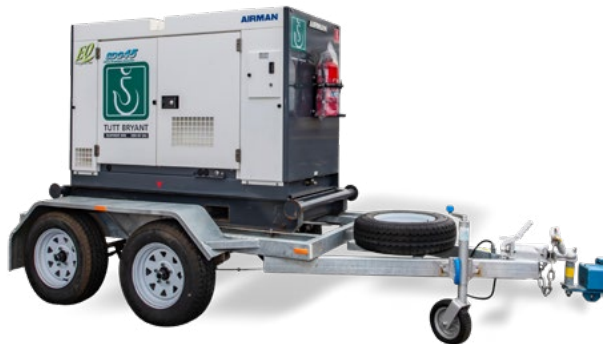
PORTABLE & TRAILER MOUNTED