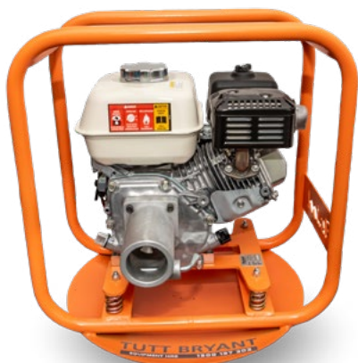
LIGHTWEIGHT AND PORTABLE