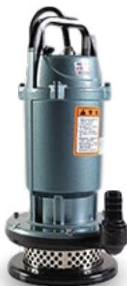
240V AND THREE PHASE