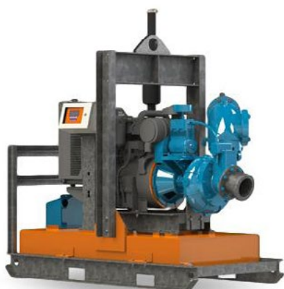
SKID AND TRAILER MOUNTED