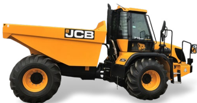
4WD & 6WD