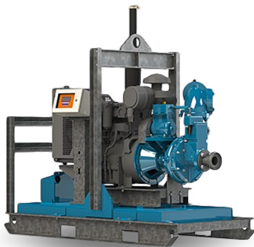
STANDARD AND XH HEAD