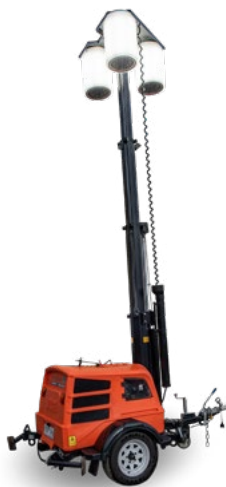
LED RANGE INCLUDES...