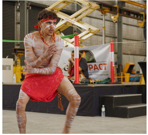
Cultural performance by the Wadumbah Aboriginal Dance Group.