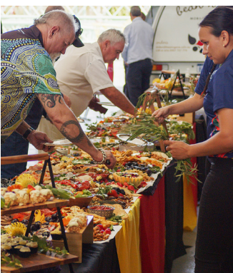
Indigenous-inspired afternoon tea.