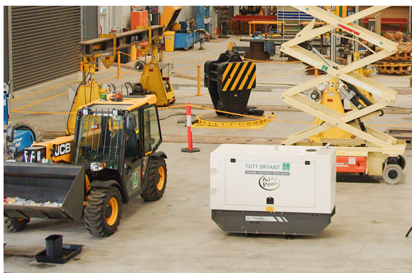
Some of Tutt Bryant's equipment on display including power generator, access, and undercarriage components.