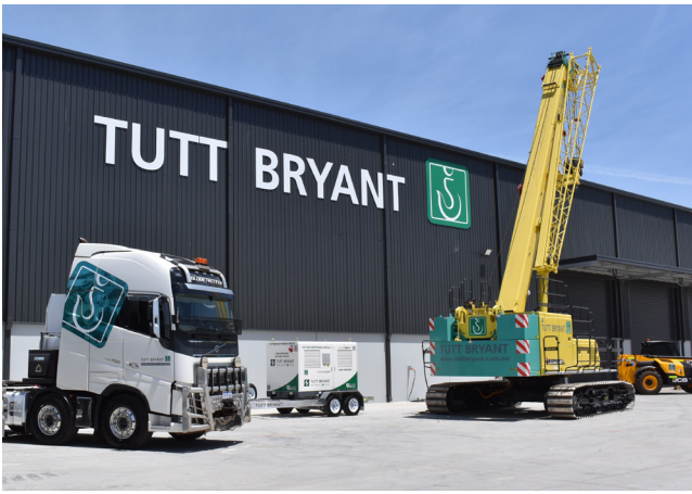
Naval Base state-of-the-art facility.